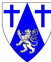
Per chevron argent and azure, two Latin crosses and a lion rampant counterchanged.